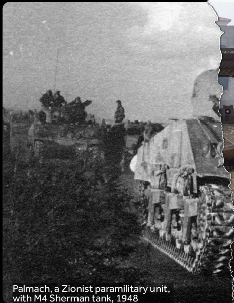
Palmach, a Zionist paramilitary unit, with M4 Sherman tank, 1948