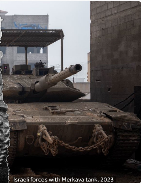
Israeli forces with Merkava tank, 2023