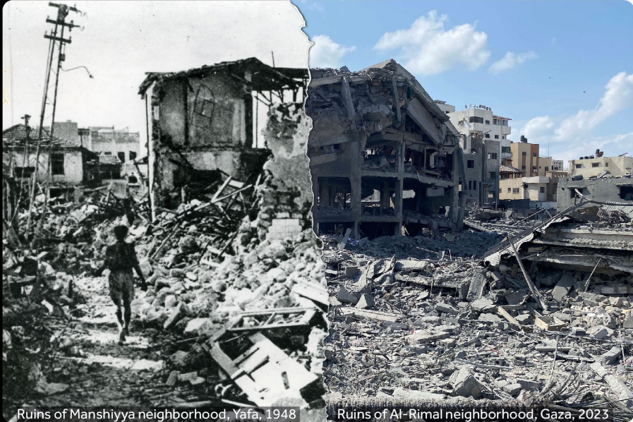
Ruins of Manshiyya neighborhood, Yafa, 1948