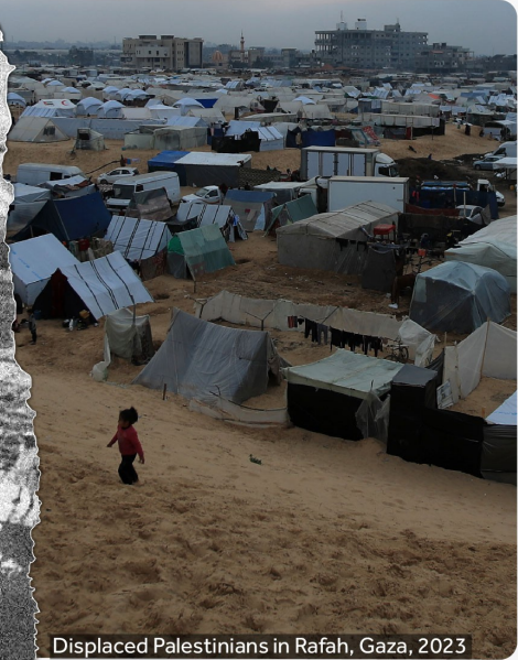
Displaced Palestinians in Rafah, Gaza, 2023